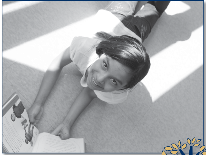
Samiktsha Sapkota Montessori Magnet School