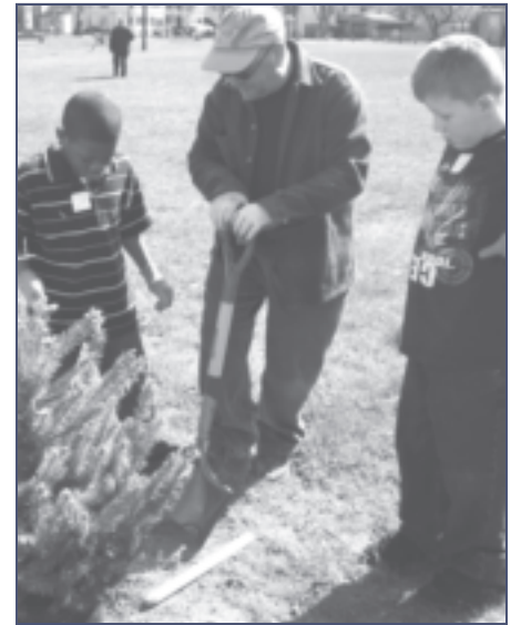
Earth Day 2010.