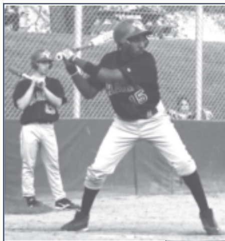
The City School District of Albany's annual budget supports a wide range of programs and services for all students, from prekindergarten through high school.