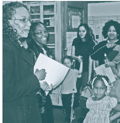
Teachers and parents visit a classroom during a tour of the Philip Schuyler Elementary School.

Parents asked good questions during a 20-minute question-and-answer session before the tour. Schuyler