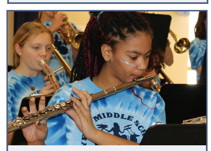
The proposed 2017-18 school budget supports musical instrument instruction beginning in third grade and continuing through high school, allowing for band and orchestra ensembles in every school. The Stephen and Harriet Myers Middle School students pictured here performed on Feb. 16 with their school's all-female jazz ensemble at the Black History Month celebration at Montessori Magnet School.