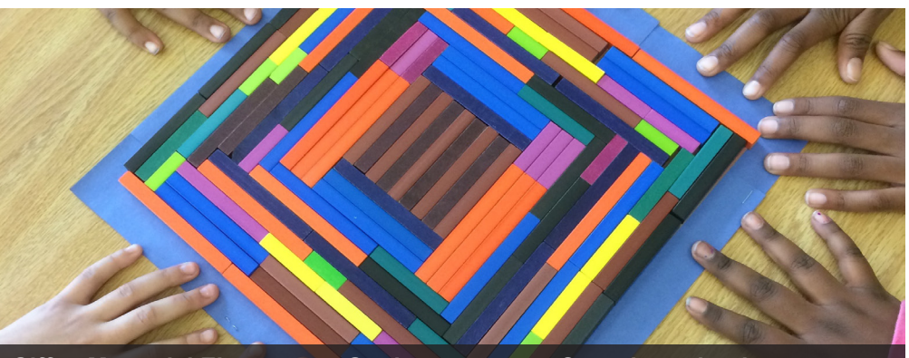
Giffen Memorial Elementary: Getting smarter at Saturday school.