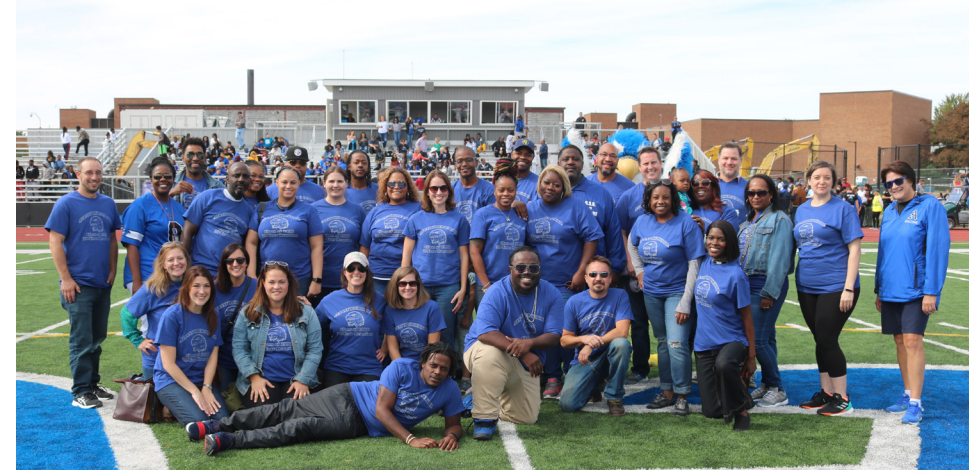
The 20-year reunion for members of the Albany High School Class of 1998 coincided with Homecoming. The group of alumni pictured here returned to their alma mater on Sept. 28 to take part in festivities at the Homecoming football game.