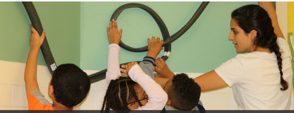
Arbor Hill Elementary: Exploring science with college students.

A new partnership in the 2018-19 school year at TOAST is taking students to new heights. Literally. After a school needs assessment was completed, St. Peter's Health Partners provided the funding for a 56-by-8-foot rock wall recently installed to cover an entire wall in the gymnasium. The climbing