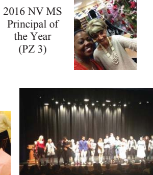
2016 Disney High School Musical