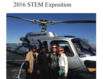
2016 STEM Exposition