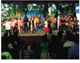
2016 Disney ES Musical