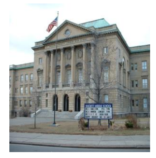
A Professional Learning Community