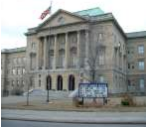
A Professional Learning Community