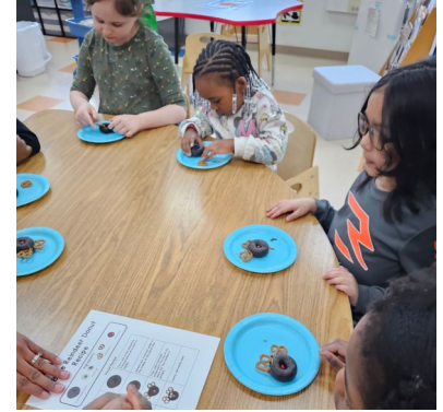
Students in Ms. Pratt's class worked on following directions to make reindeer donuts as part of their speech therapy lesson.