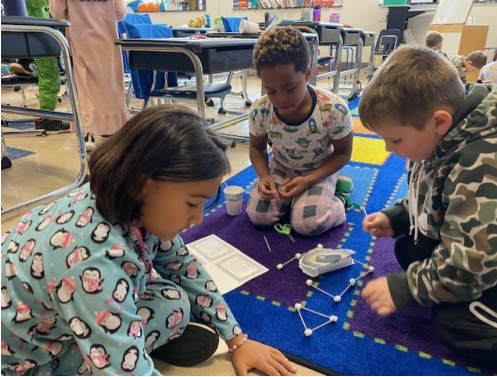
Students in Ms. Moore's classroom completed a STEM project for Thanksgiving. Many of our lessons encourage students to be problem-solvers.