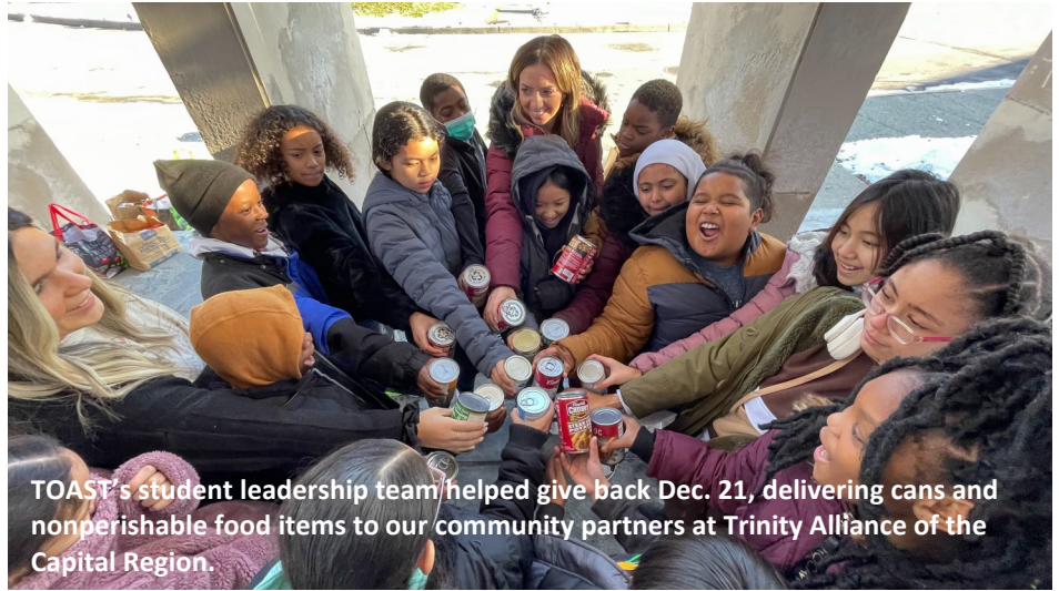
TOAST's student leadership team helped give back Dec. 21, delivering cans and nonperishable food items to our community partners at Trinity Alliance of the Capital Region.