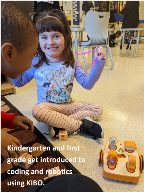
Kindergarten and first grade get introduced to coding and robotics using KIBO.